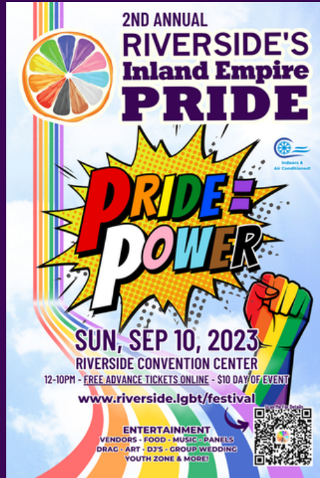
Theme: Pride = Power